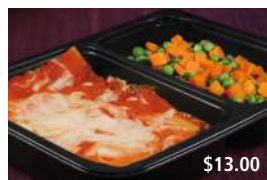
Beef Lasagna with Peas & Carrots