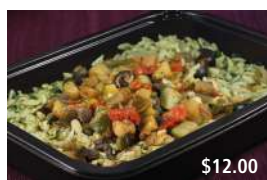
Vegetable Caponata with Orzo & Spinach