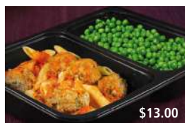
Meatballs With Penne Pasta & Peas