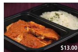
Roast Turkey Pizzaiola & Rice Pilaf