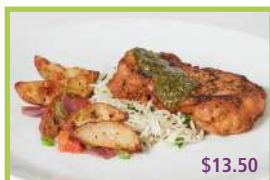
Marinated Chicken with Cilantro Rice & Roasted Potatoes