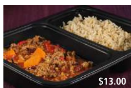
Turkey Chili with Brown Rice