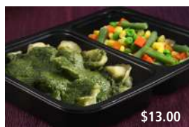
Cheese Tortellini with Pesto & Mixed Vegetables