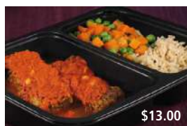
Meatloaf & Tomato Sauce, Brown Rice with Peas & Carrots