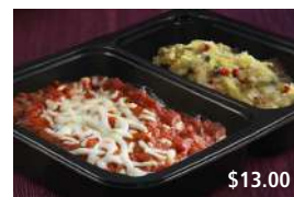
Eggplant Parmigiana and Polenta with Spinach & Roasted Peppers