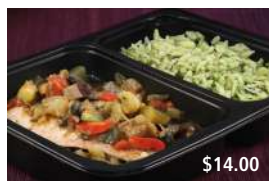
Salmon Caponata with Orzo & Spinach