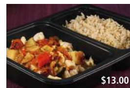
Italian Style Chicken Breast (Caponata) with Orzo & Spinach