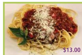
Spaghetti Pasta with Beef Bolognese