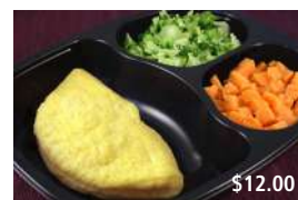
Plain Omelet, Sweet Potatoes & Broccoli