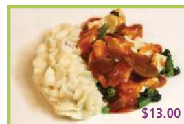
Chicken Marsala with Mashed Potatoes