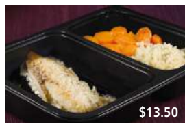
Baked Tilapia, Brown Rice & Minted Carrots

"MK Signature Meals" are our premium line of complete meals, denoted with a special icon. These meals are designed to be nutritionally balanced and appropriate for various special diets. Special care is taken to use top quality ingredients and to ensure the meals are extra tasty and flavorful. More meal selections are available online.