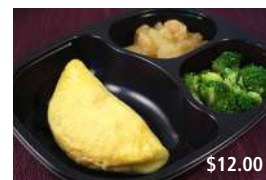
Cheese Omelet, Broccoli & Cinnamon Apples