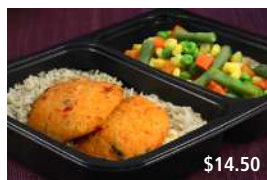
Crab Cake, Brown Rice & Mixed Vegetables