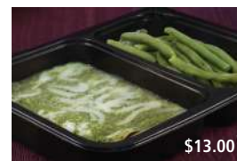
Spinach Mushroom Lasagna with Garlic Green Beans