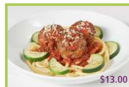
Chicken Meatballs with Spaghetti & Zucchini