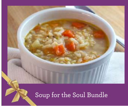
Soup for the Soul Bundle