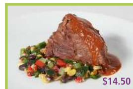
Braised Short Ribs with Black Bean & Corn Medley