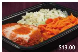
Chicken Parmigiana, White Rice and Carrots