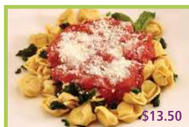
Cheese Tortellini with Pomodoro Sauce