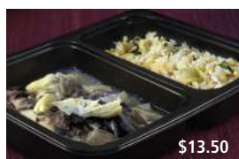
Tilapia & Rice Pilaf with Mushroom & Artichoke Hearts