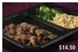
Beef Bourguignon, Brown Rice & Broccoli