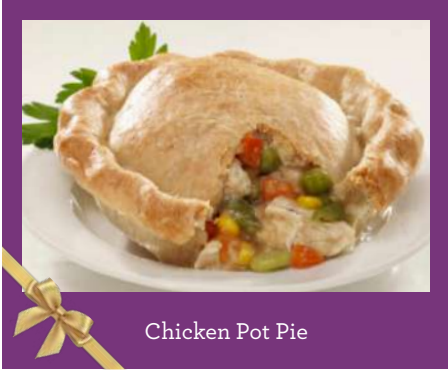
Chicken Pot Pie

Practical gifts for the loved ones in your life