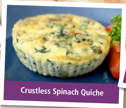
Crustless Spinach Quiche