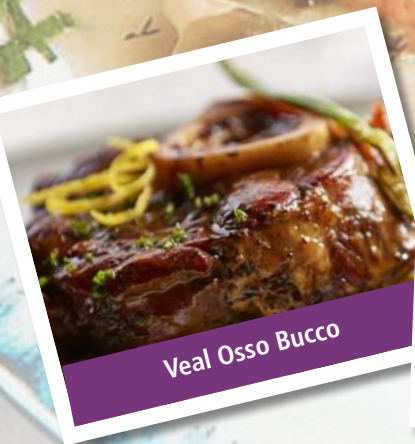
Veal Osso Bucco