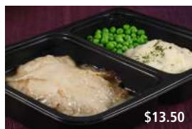
Roast Turkey with Gravy & Mashed Potatoes with Peas