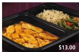
Chicken Paprika with Brown Rice and Green Beans