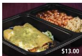
Chicken Cheese Enchilada with Tomatillo Sauce, Rice & Pinto Beans