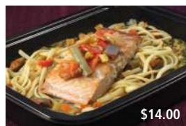
Salmon & Vegetable Linguini