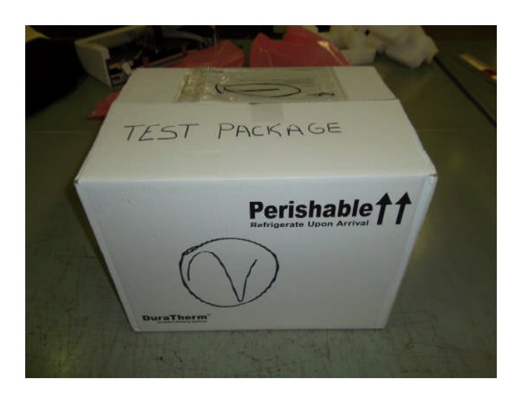
Views of the Shipping Container and EPS Foam Cooler