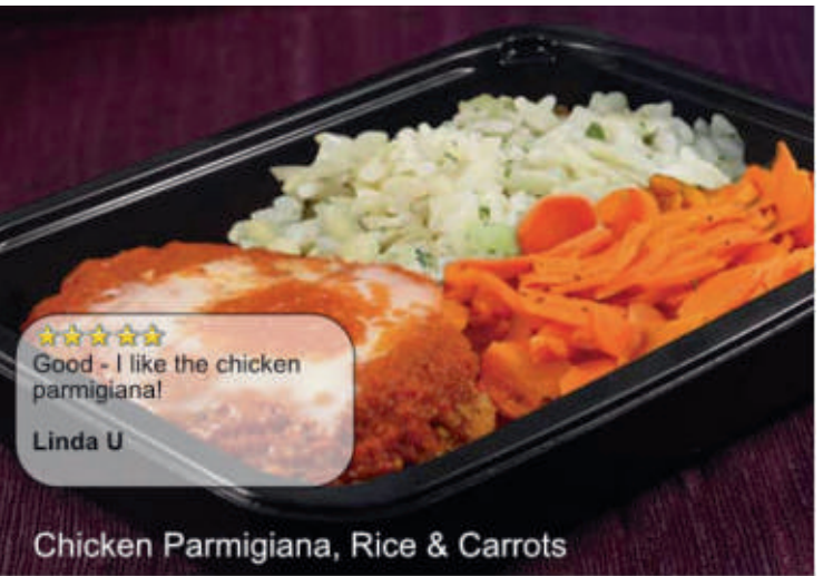
A complete meal after being heated in the tray