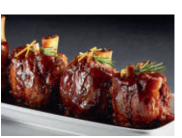
Balsamic BBQ Pork