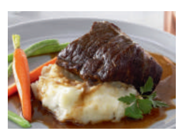
Classic Short Rib