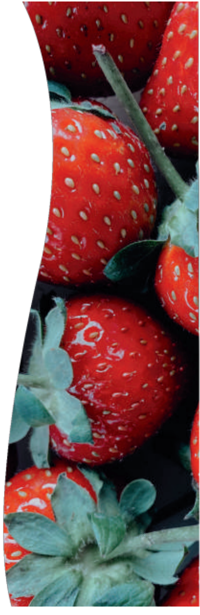
"Spring unlocks the flowers to paint the laughing soil."