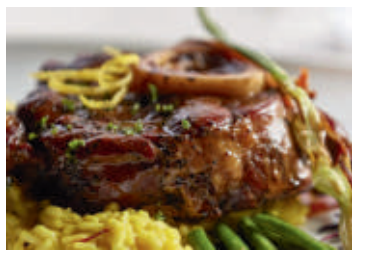
Veal Osso Bucco

Four different meat dishes are available for you to try, with two more coming very soon! Pair them with one of our easy side dishes, or serve up a great green salad. Either way, the homestyle meats will be the star of the dinner! Just cook in a pot of boiling water or in a steamer for about 20 minutes, and dinner's on the table!